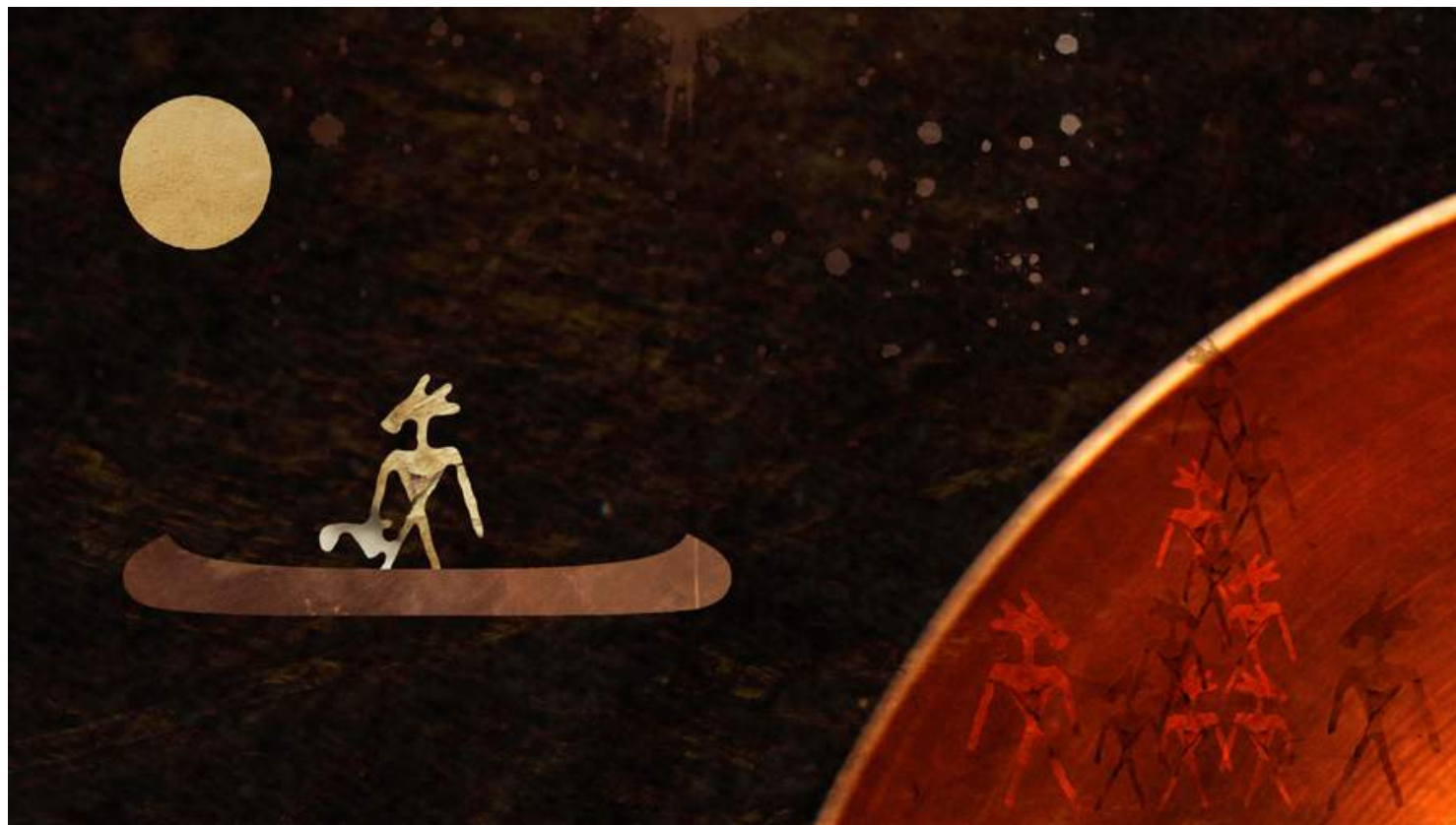
The Path Without End Stop Motion Animation 2011 Director & Artist