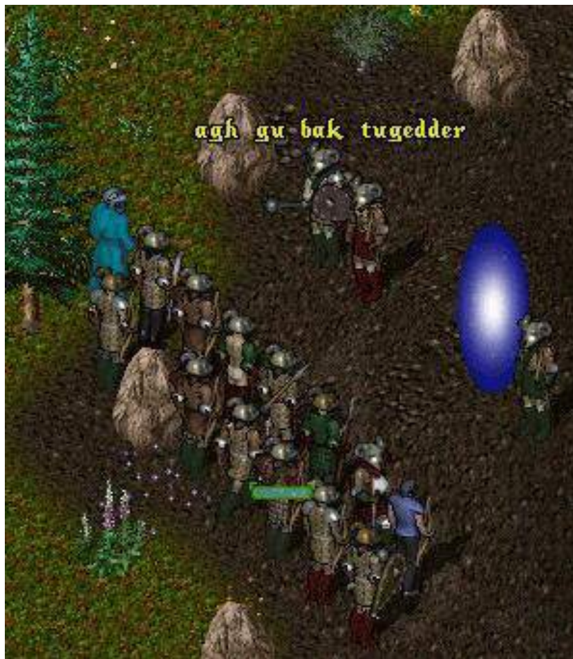
Shadowclan Orcs Ultima Online