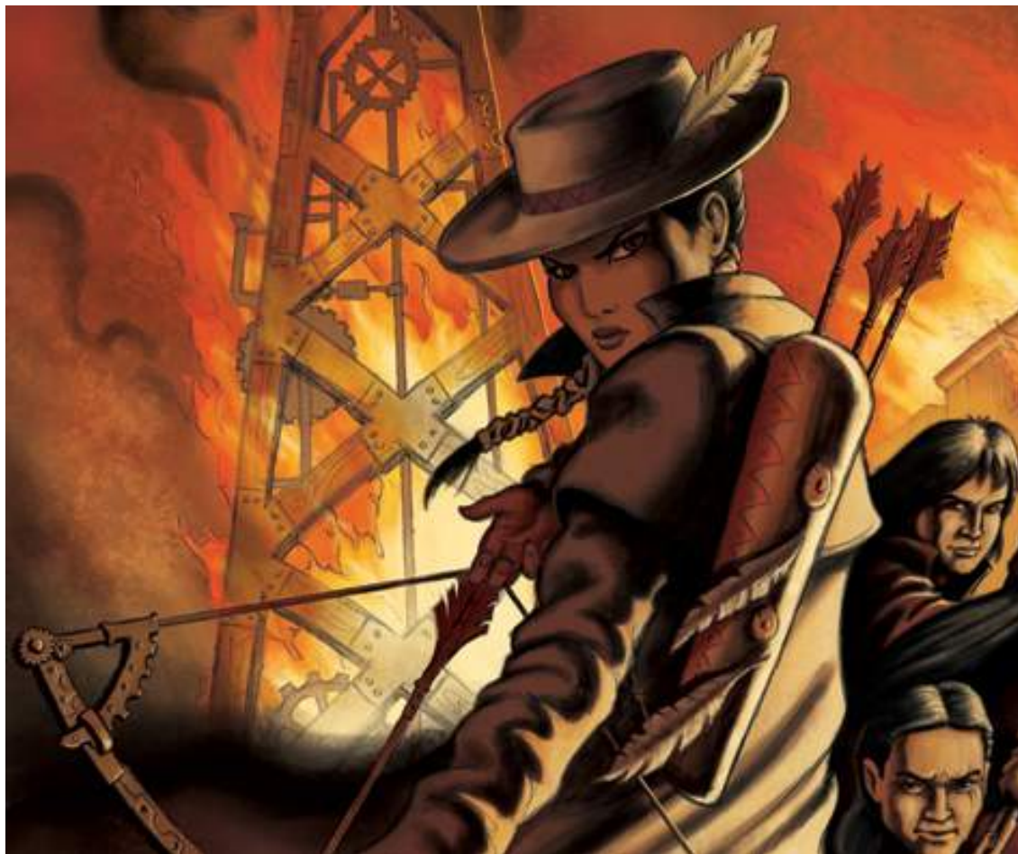
The West Was Lost Web Comic 2008 Writer Zeros2Heroes, Inc.