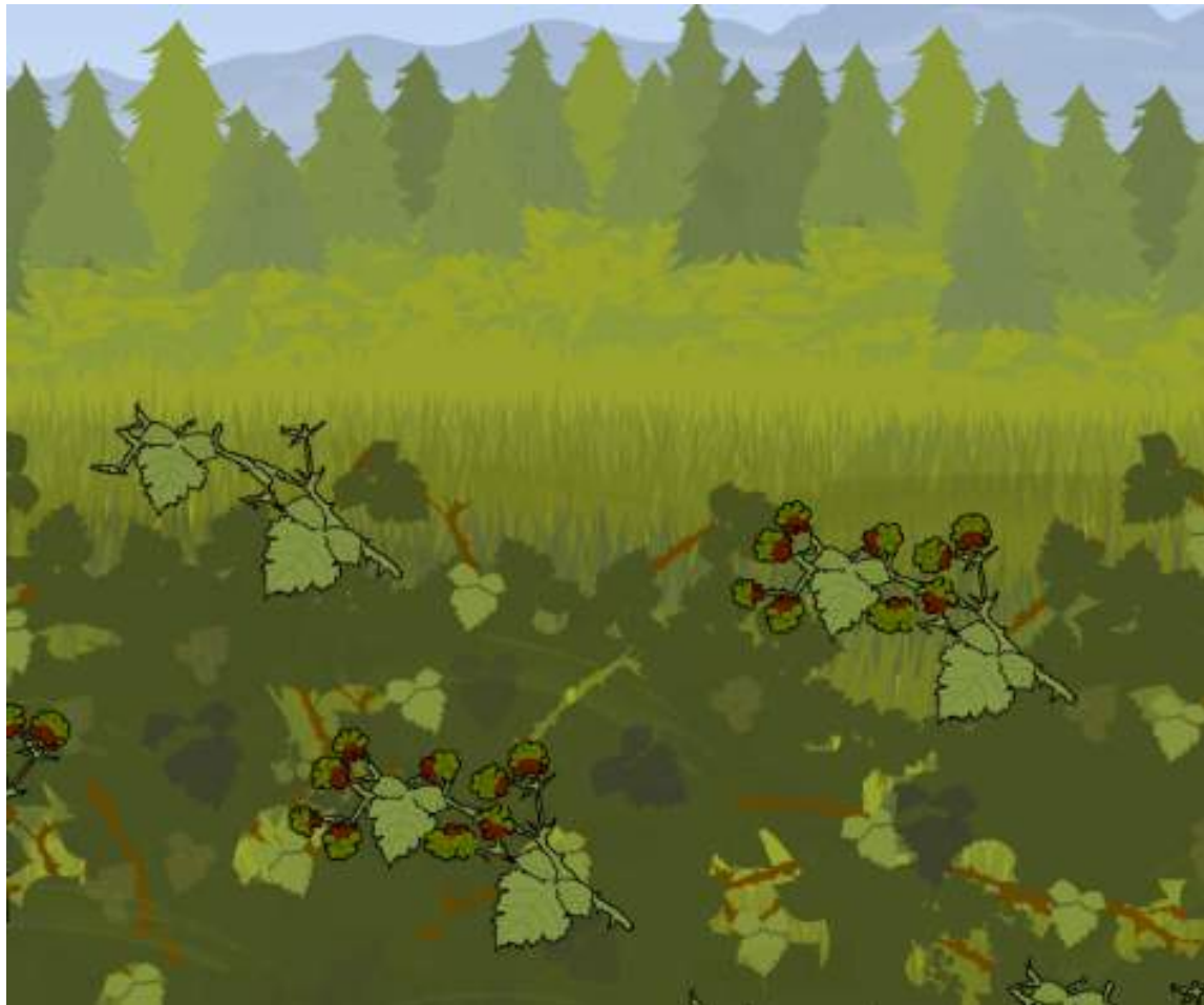
Gathering Native Foods Touchscreen Games 2014 Co-Designer Oregon Museum of Science and Engineering