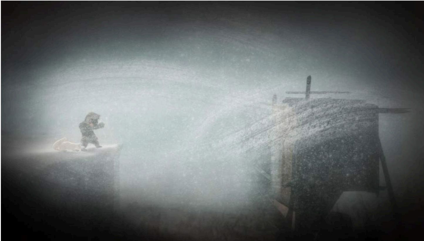
Never Alone PC/Console Game 2014 E-Line Media with Cook Inlet Tribal Council